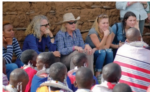
FoTZC board members listening to the concerns of villagers