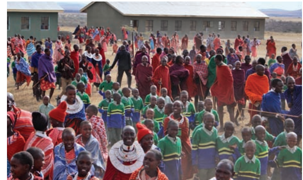
Orkuyene village turned out to thank FoTZC for their new school when the board visited in November, 2018