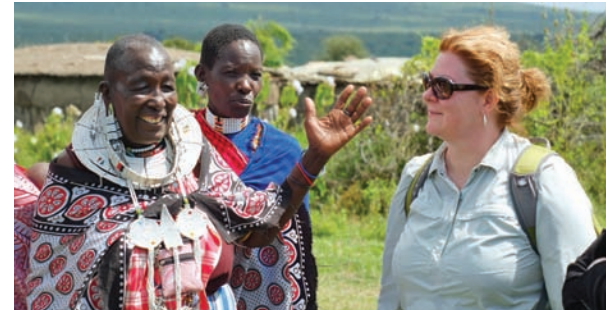
Nakaki talks to FoTZC board members