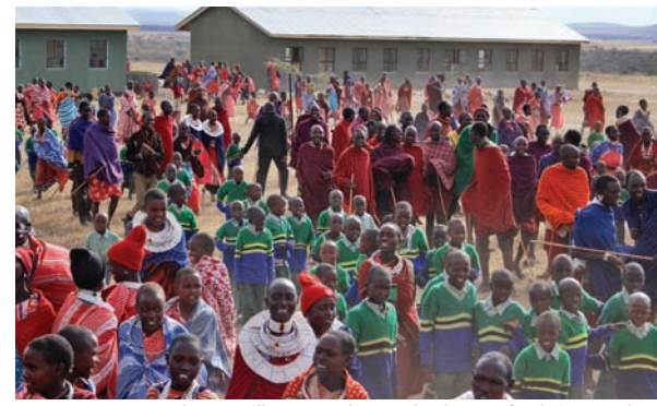
Orkuyene village turned out to thank FoTZC for their new school when the board visited in November, 2018