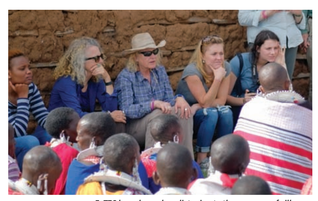
FoTZC board members listening to the concerns of villagers