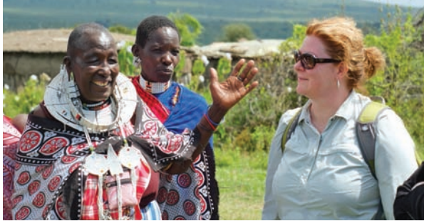
Nakaki talks to FoTZC board members