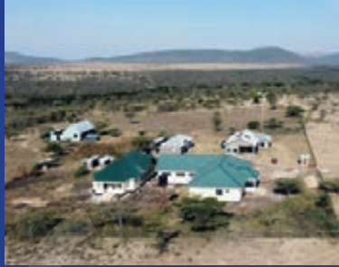
Aerial view of health center

I have been a donor since a 2020 safari. When we visited the Sukenya Dispensary and interacted with Maasai business women, we became aware of the local needs and desires that drive FOTZC projects. I am pleased my donations are helping to improve family outcomes and strengthen local economies in the FOTZC partner communities.”